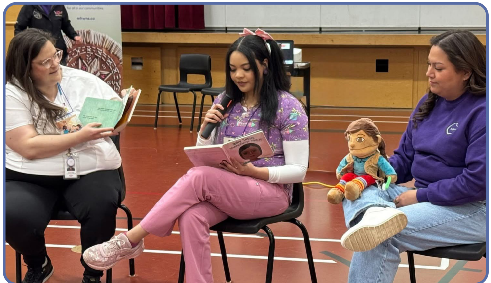
Reading of the Weskewikwa'sit mijua'ji'j - Baby Smiles book.

The plan was simple: start with games, share some snacks, and end with a live reading of the Weskewikwa'sit mijua'ji'j - Baby Smiles book. Children moved between activities at their own pace. Parents and caregivers talked to each other and with staff, sharing stories and asking questions.