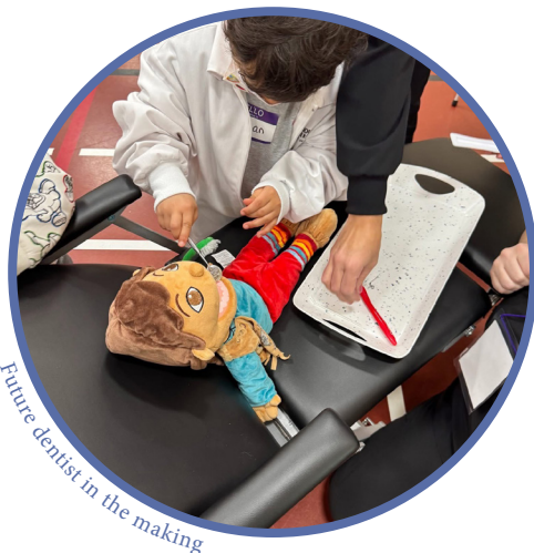
Future dentist in the making