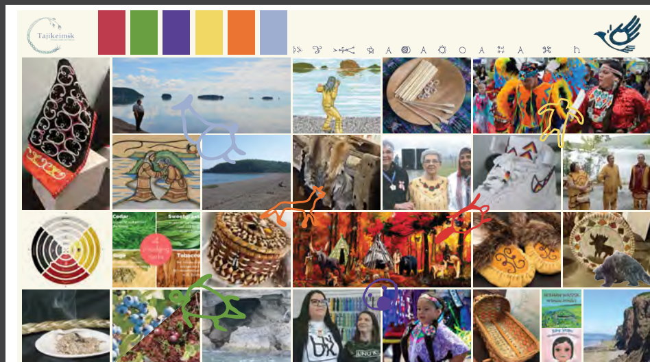
The mood board that was part of the illustration process for Tajikeimik's Early Years Toolbox.